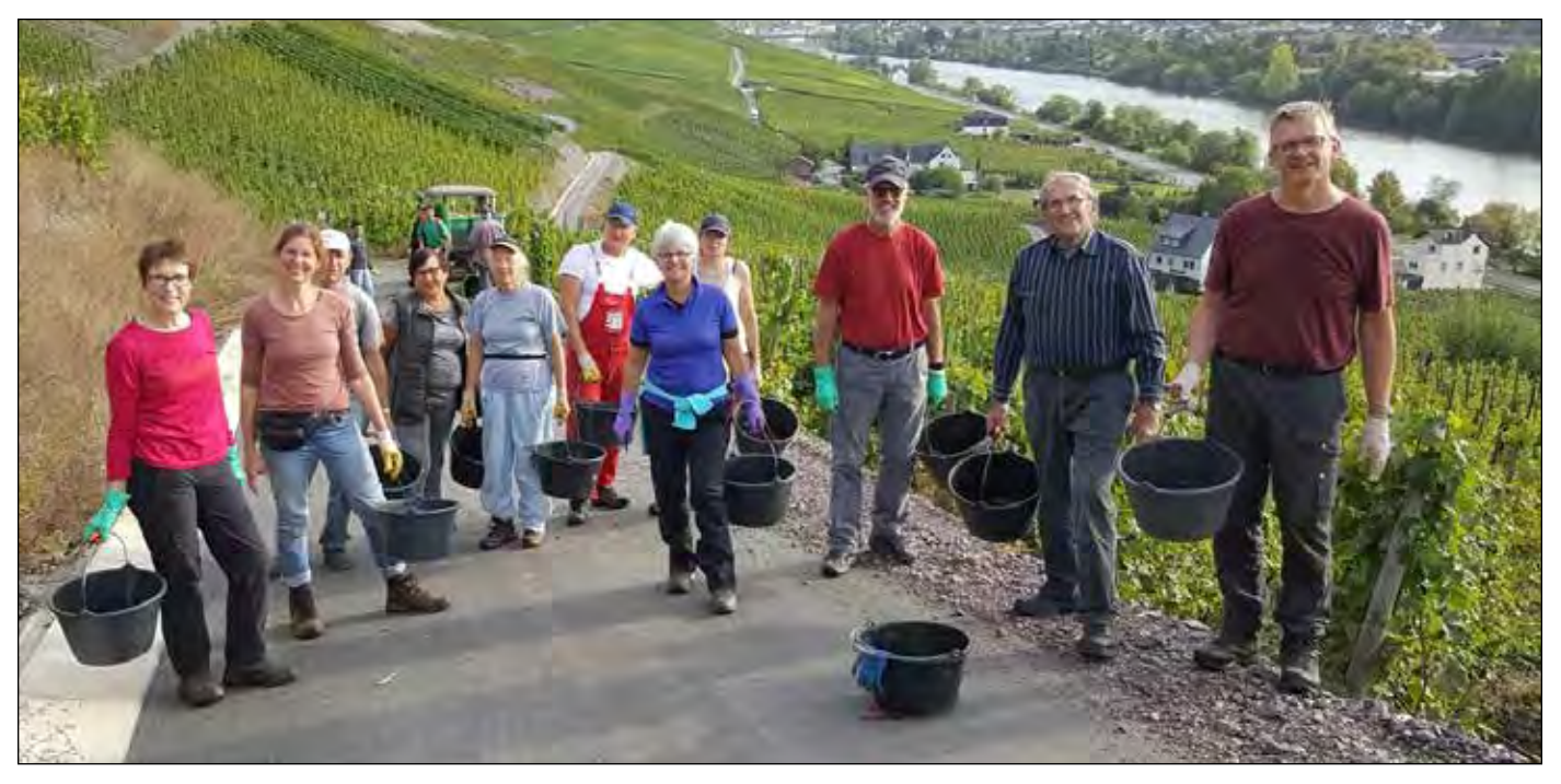
The dry and warm 2018 growing season proffered fully ripe grapes, in abundance, resulting in outstanding dry and fruity wines, and some great noble sweet wines. Here, the harvest crew (including owners and friends) for Weingut Willi Schaefer treks to the winery's next small plot of Graacher Himmelreich, one of the world's great Riesling vineyards—because the vineyard parcels are not contiguous.

he 2018 vintage in Germany was an excellent one, producing both high quality wines and abundant quantities: yields were 37% higher than in 2017—which was a short crop, down 17% compared to 2015 and 2016—and well above the prior decade's average.